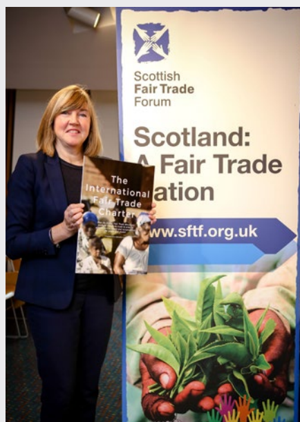
Alison Johnstone MSP