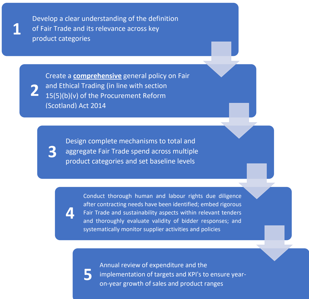
Diagram 1. The Forum's proposed process for Contracting Authorities to successfully embed Fair Trade within procurement activities

Key steps can be taken by CA procurement officials and policy makers, the Scottish Fair Trade Forum (the Forum) and Fair Trade campaigners to encourage and develop the market for Fair Trade procurement in Scotland. Recognising procurement's crucial role in building the market for Fair Trade in Scotland in its independent report for the Scottish Government, Martin Meteyard & Associates advocate that priority should be given to encouraging authorities to set a baseline for expenditure on fair and ethical goods. It is the intention that such baselines can encourage a progressive approach to Fair Trade procurement whereby CAs set indicators and targets to grow, year-on-year, their expenditure on fair and ethical trade and expand product ranges. The setting of baselines and targets represents an important stage (stage 3) in a wider process proposed by the Forum for successfully embedding Fair Trade within procurement activities (see Figure 1 below).